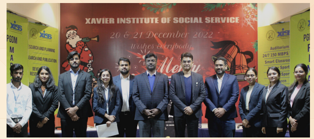
Winners of events organised during the "Samvad 3.0" media interaction