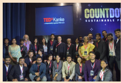
XISS students with TedxKanke Countdown speakers on Sustainable Planet