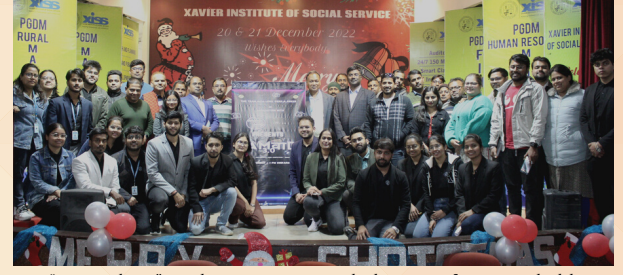
"Samvad 3.0" media interaction with the press fraternity held at XISS

https://xiss.ac.in/readmore/xiss-organizes-samvad-3-0-media-interaction-with-the-press-fraternity